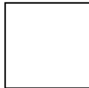
Samsara - Reincarnation